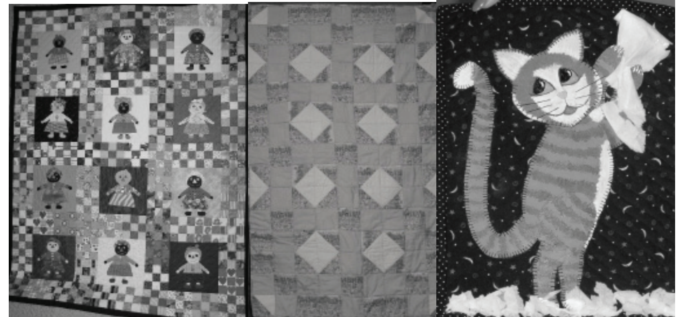
The Sew and Sew Bee group quilted this awesome Twin size quilt called "Best Friends Forever" The Pin Droppers Bee, in the Windcrest area, asked the Sew and Sew Bee to quilt it.